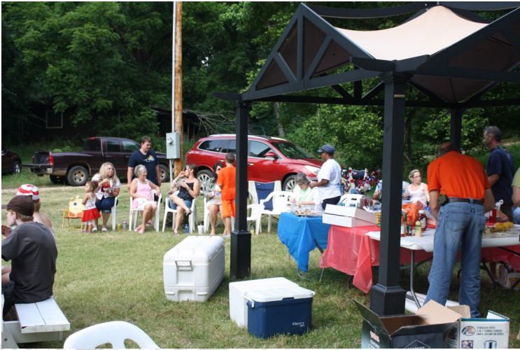
The shrimp boil is a great way to prepare for the fireworks performance.